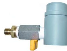
RTI Adapter for BMW Special Hose Part Number 370-80172-00 (Use 1-3/4 in. hose for other connection)

One of the special adapters to the right is required for connecting the MCX to this type of special hose.