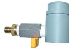
RTI Adapter for Audi Special Hose Part Number 370-80175-00 (Use 1-1/2 in. hose for other connection)