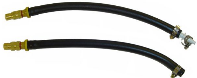
RTI Adapter for Pressurized Reservoir Part Number 370-80173-00

2001 Saturn L Series 2001 Green hose connection going into the block/thermostat, black hose on return from sealed reservoir. Clamp must be installed.