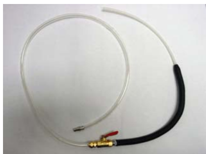
Flexible Fill Tube with Control Valve