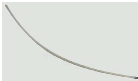
Rigid Fill Tube