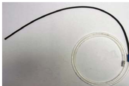
Dip Stick Extraction